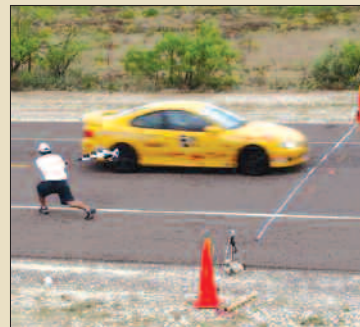
Fort Stockton Big Bend Open Road Race

For Swartz's expert branding advice go to www.taglineguru.com (click on Articles).